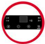
Touch Panel Controls