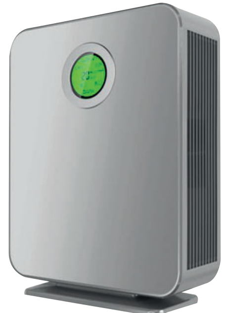
Floor Stand Included

Copyright © 2002 – 2020 Air Conditioning Centre / Martin Industries Air Conditioning Centre is a registered trademark of Martin Industries Ltd. E&OE. Registered in England & Wales Co. No. 05436428