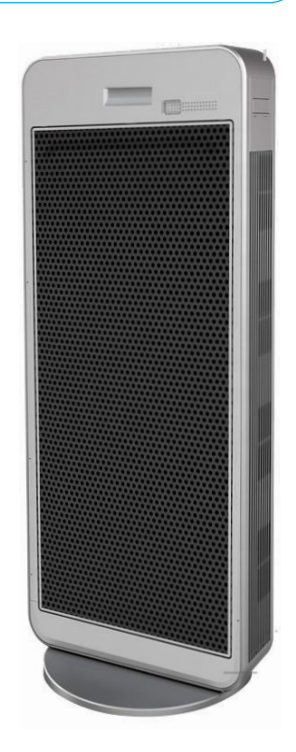
Floor Stand Included

Air Conditioning Centre is a registered trademark of Martin Industries Ltd. E&OE. Registered in England & Wales Co. No. 05436428