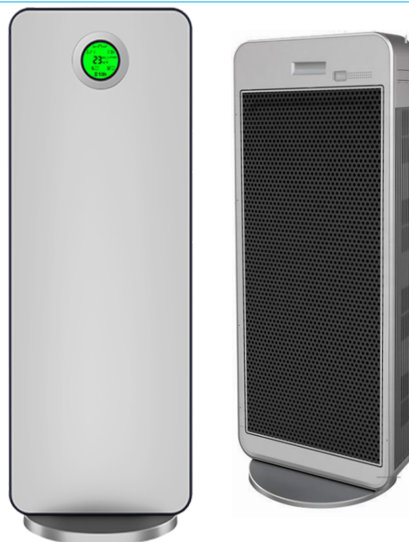
Floor Stand Included

Air Conditioning Centre is a registered trademark of Martin Industries Ltd. E&OE. Registered in England & Wales Co. No. 05436428